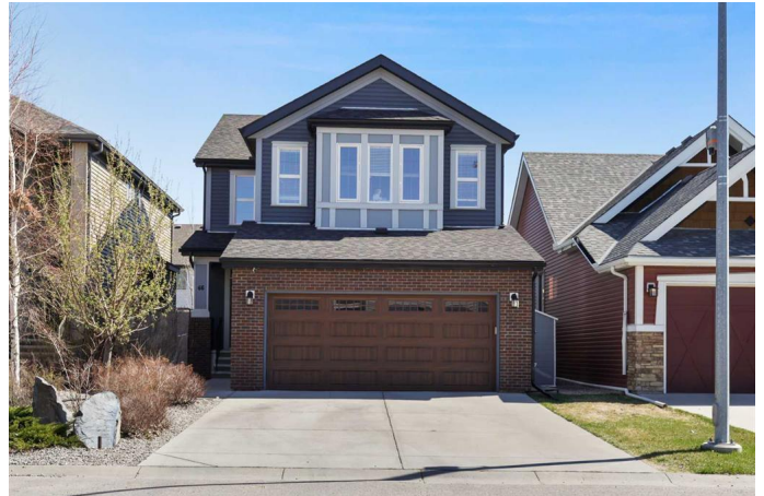
66 COPPERPOND HEATH SE

** Custom Former Show Home ** - Family Approved - Five bedrooms + two dens ** Extensive upgrades and superior quality, with 3,500 square feet of air-conditioned, luxurious living space. ** You will be impressed with the privacy of an oversized traditional homesite with a private south-facing backyard with a bespoke 13' x 12' covered deck. This seasonal, airy design provides relief from the sunniest to the snowiest days while providing an uninterrupted view of the surrounding gardens. Enjoy this convenient Copperfield Location - steps away from the ponds, Ice rink, parks, pathways, schools, shopping, soccer fields, skate park, healthcare, transit, South Pointe Hospital, and the major south expressways. Living a community lifestyle makes Copperfield an outstanding, safe, and secure community. Rich curb appeal with architectural features - dramatic roof lines, 24' x 21' attached garage with wood-style detailed door & full-sized concrete driveway, covered entry, and brick-faced front complete this spectacular elevation. There are extensive upgrades throughout, and the details are superb. This is a must-see home! Chefâ€™s kitchen includes granite countertops, custom light wood shaker style cabinets/doors, extension trims, high-end KitchenAid stainless steel fridge/dishwasher/microwave/wall oven, gas cooktop range with five burners, recessed lighting, oversized central island, peninsula island with a flush eating bar & black granite under mount sink, extra cabinet storage & a